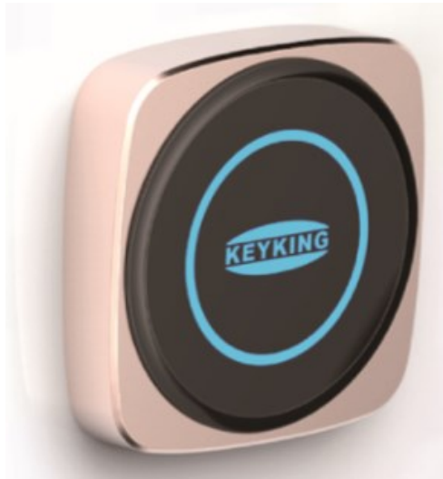
RY01P ( Proximity Reader)